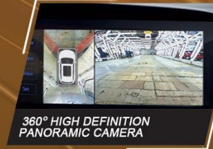
360° HIGH DEFINITION PANORAMIC CAMERA