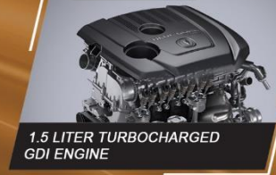
1.5 LITER TURBOCHARGED GDI ENGINE