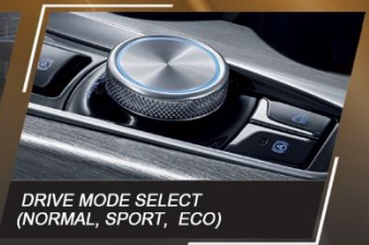
DRIVE MODE SELECT (NORMAL, SPORT, ECO)