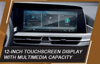
12-INCH TOUCHSCREEN DISPLAY WITH MULTIMEDIA CAPACITY